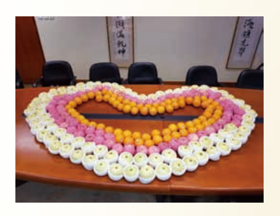
"A healthy body makes a healthier mind and happier person" – the Group provides fruits to employees regularly.