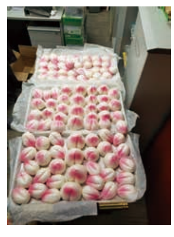
Photo I 🗐 1 In celebration of 2018 Renri, we had Longevity Bun together and wishing everyone a prosperous and healthy year.